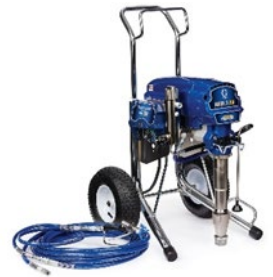
Fig.7: Airless spray