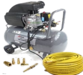
Fig.3: Air compressor with hose