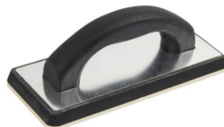
Fig.5: Rubber float