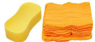
Fig.6: Sponge or dry cloth