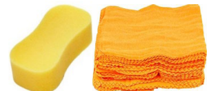
Fig.6: Sponge or dry cloth