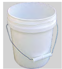
Fig.3: Empty bucket