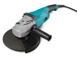
Fig.5: Hand-held grinder