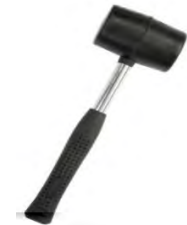
Fig.6: Rubber hammer