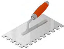
Fig.4: Notched trowel