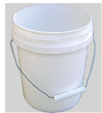
Fig.3: Empty bucket