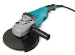
Fig.5: Hand-held grinder