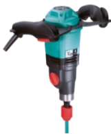
Fig.1: Mixing drill