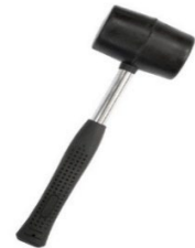
Fig.6: Rubber hammer