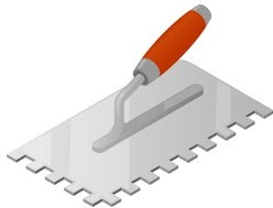
Fig.4: Notched trowel