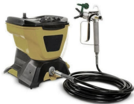
Fig.4: Airless spray