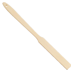
Fig.1: Mixing stick