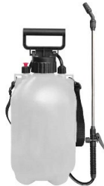
Fig.1: Low pressure sprayer