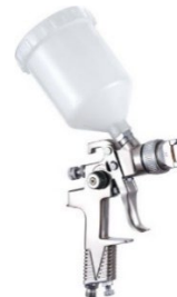
Fig.6: Low-pressure gun