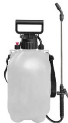
Fig. 5: Low-pressure sprayer