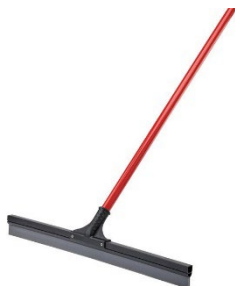
Fig.4: Soft rubber squeegee