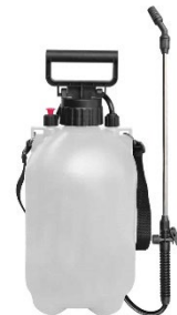
Fig.5: Low pressure sprayer