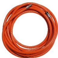
Fig.1: Standard garden hose