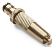
Fig.2: Spray nozzle