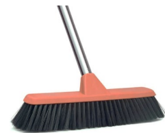
Fig.3: Wide soft push broom