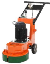
Fig.2: : Grinding or grit blasting machine