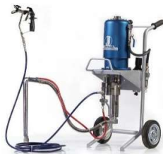
Fig.6: Airless spray machine