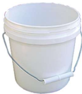
Fig.5: Empty bucket