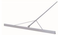
Fig.1: Straight edge trowel Fig.2: Mechanical spreader Fig.3: Highway straight edge