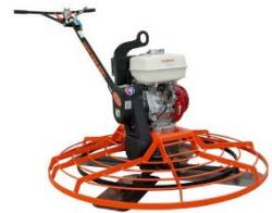
Fig.4: Bull float Fig.5: Wooden bull float Fig.6: Power trowel/Helicopter